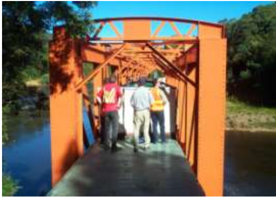
Figure 14 Iron Bridge clearance trial for proposed freight wagon. c2001 (Cooper)